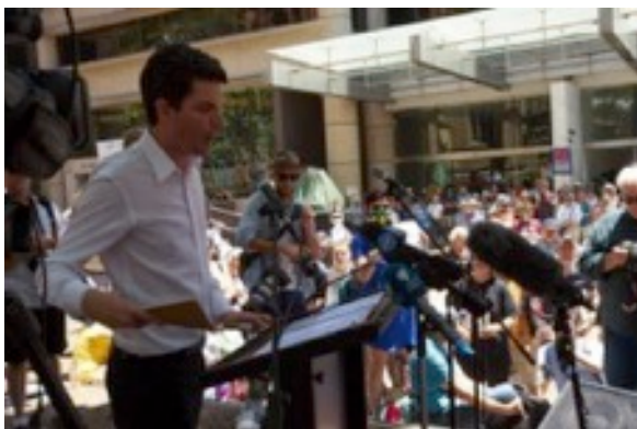
Greens Senator, Scott Ludlum