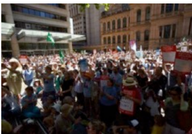
A section of the crowd