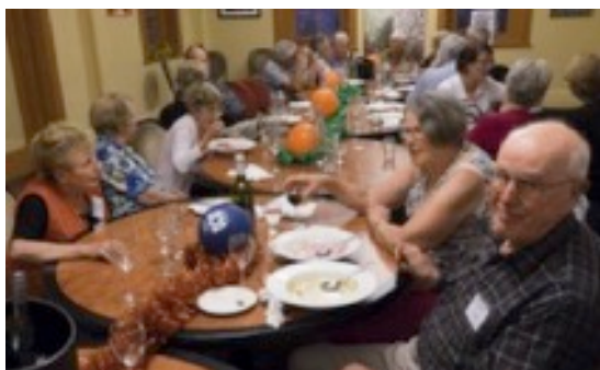
Our members enjoying the night

Twenty seven of our members attended a night which was great fun and enjoyed by all.